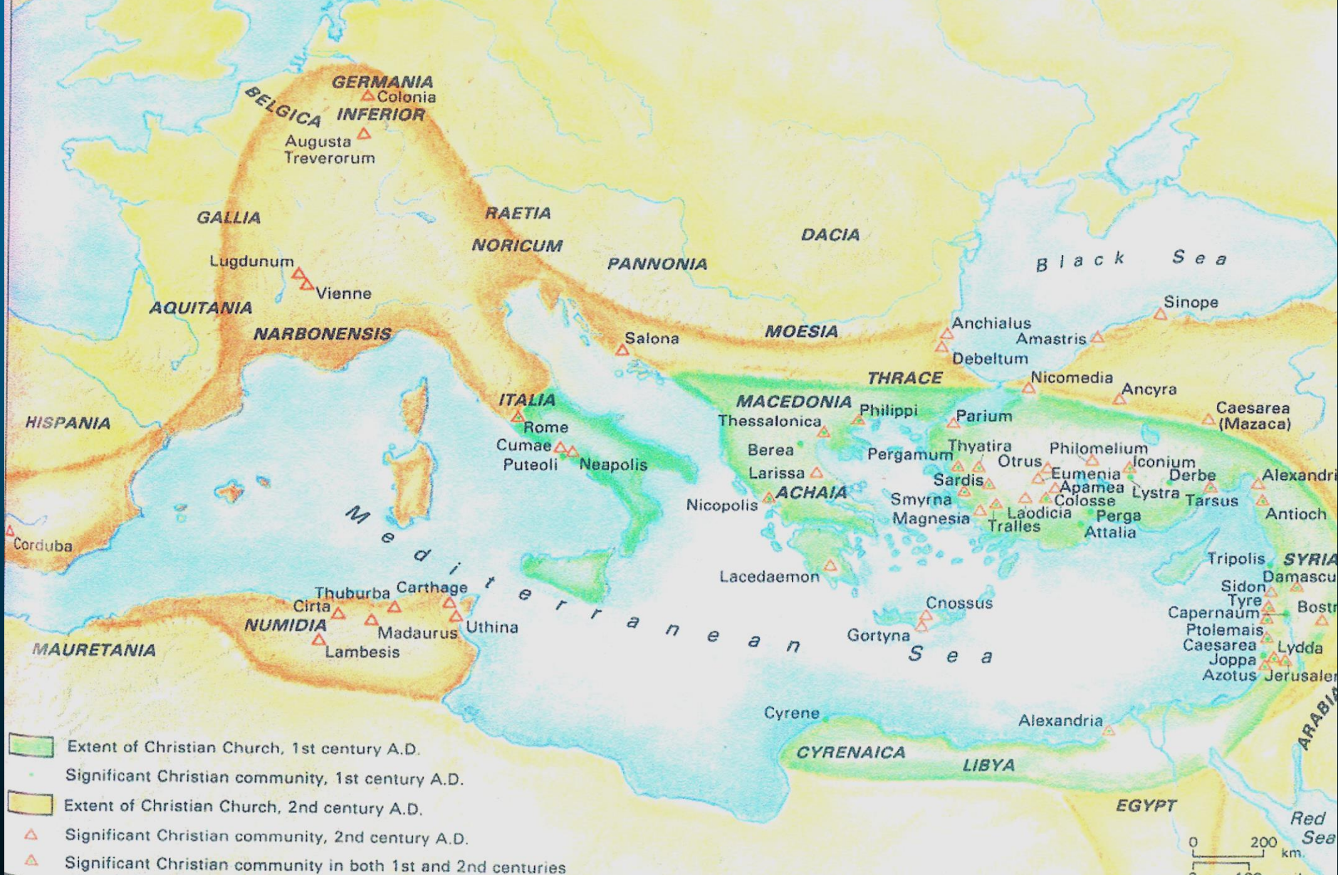
THE EXTENT OF CHRISTIANITY IN THE 1ST AND 2ND CENTURIES A.D.