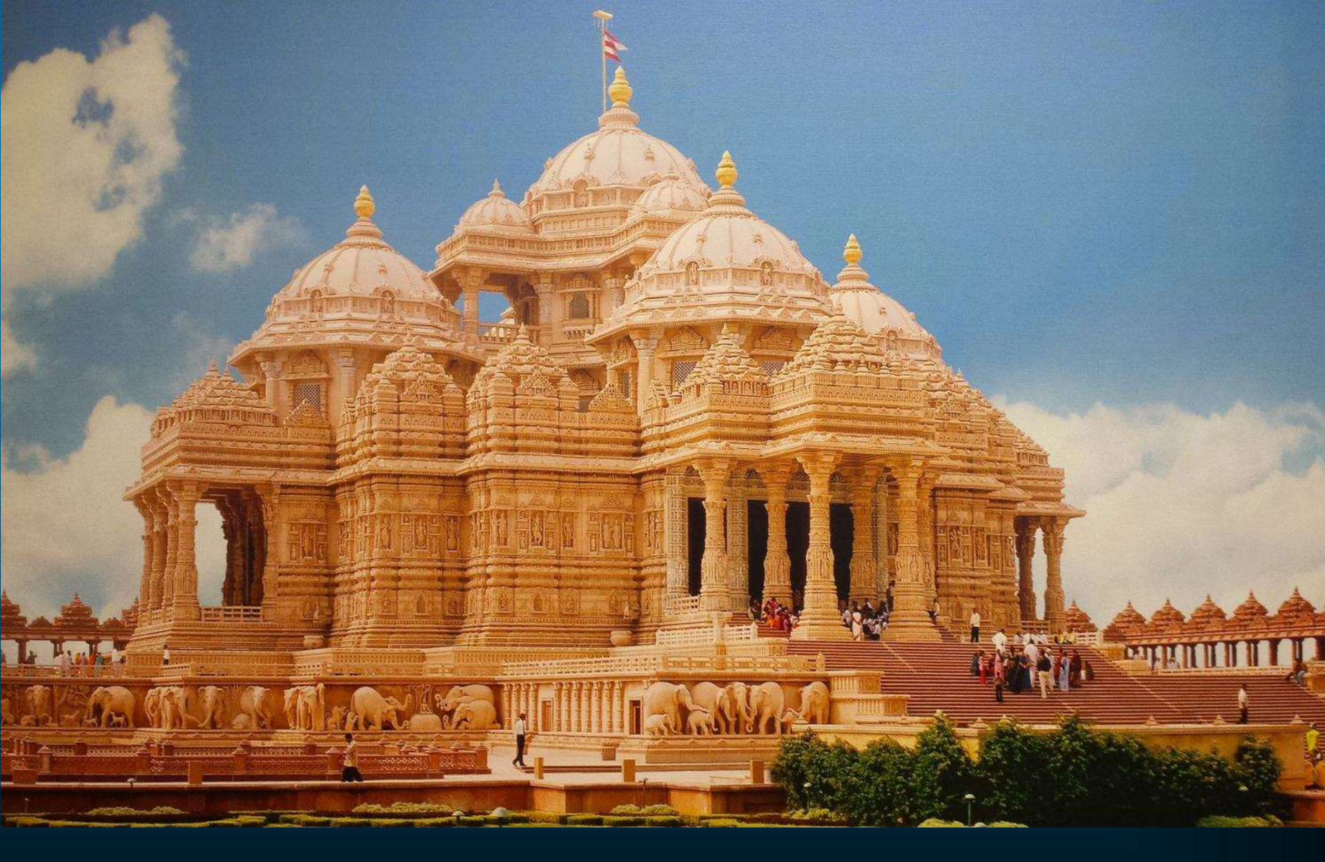
Swaminarayan Akshardham Temple in Delhi